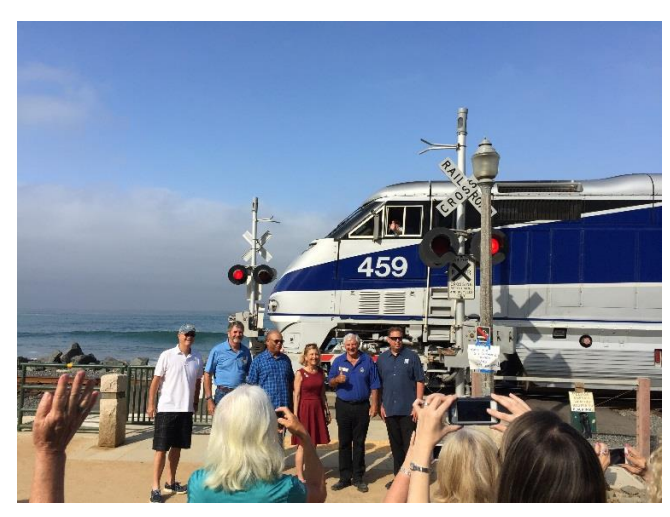
Schedule / Cost