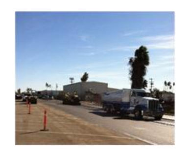
GG Asphalt Pavement Overlay